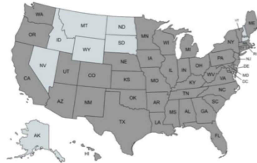
Created with mapbox.com States participating in the Second Chance Pell Experimental Sites Initiative as of 1/1/2022